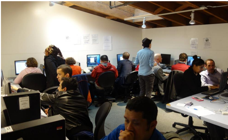
The Arc SF Learning Lab: a full house all day long