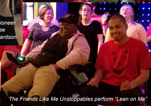
The Friends Like Me Unstoppables perform "Lean on Me"