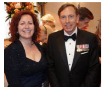
Hanscom with General Petraeus